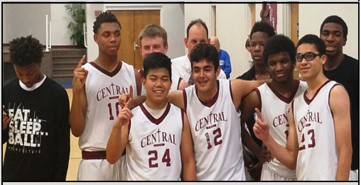
Above: Varsity Basketball boys celebrating their Championship win!

At Right: Varsity girls with their Runners-up trophy