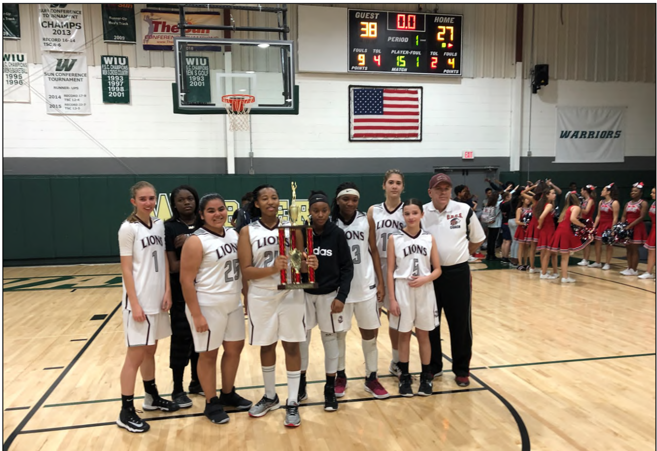
CBCS Lady Lions Basketball Team Captures 2nd Place in State!