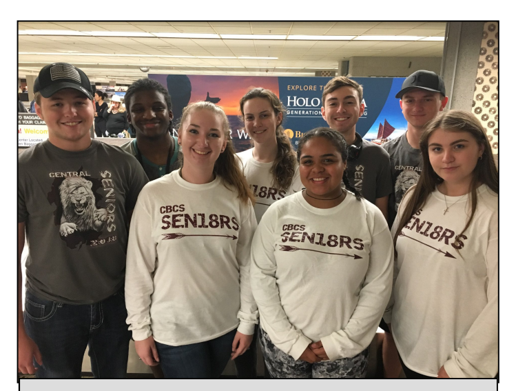
Here they are in the Honolulu airport just after landing. In their "CBCS Seniors" shirts, they look amazingly wide-awake after a very early 5:00am start in the Tampa airport!