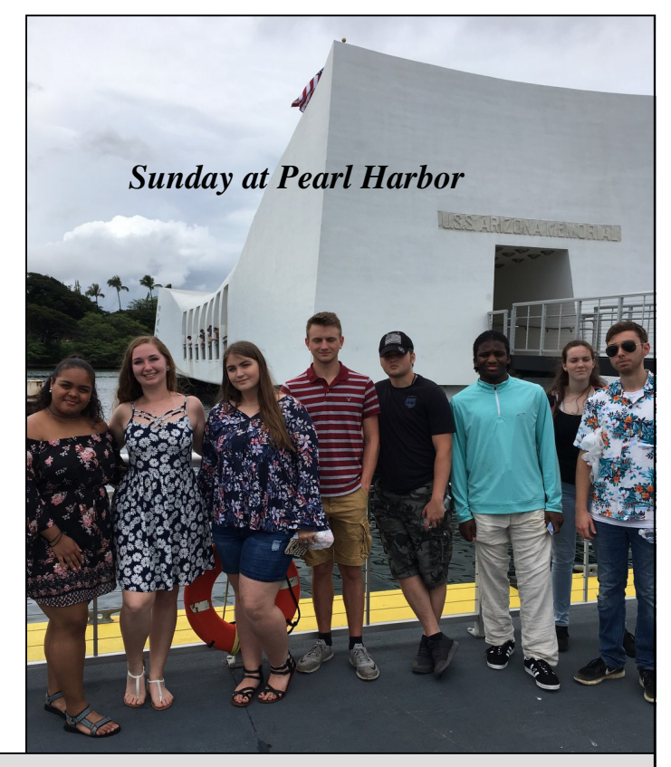
Above Right: After church and lunch on Sunday, the students toured and paid their respects at the Arizona Memorial. Then they enjoyed the beach at Waimea Bay. The next day they were all ready for paddle boarding and surfing lessons.